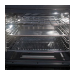
COMMERCIAL STYLE OVEN FITTINGS Anniversary range cookers feature the new heavy duty commercial grade trays, liners and telescopic racks that will never bow or twist even when using cast iron pans and trays. Made from easy to clean, high grade, 6mm thick 304 grade stainless steel.

Make every dish just a tad more delicious: the steam generator allows for a constant, 100% steam saturation of the entire oven space, which secures that natural textures, colours and flavours of the food are retained together with more nutrients and vitamins.